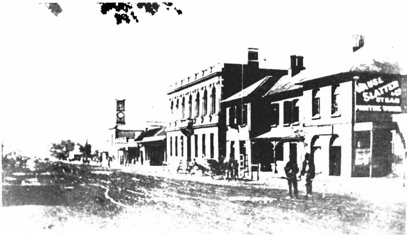
A view of Church Street, Pietermaritzburg, in the 1880s from the corner of Timber Street looking towards the Presbyterian Church and Market Square. This is the main street as John Bird knew it. The central building in the picture contained the early municipal offices. The unpaved street is rutted by waggon-wheels. On the pavement can be seen two hitching-rails.